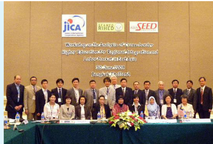
JICA-RI releases a policy brief based on workshop discussions and a research project on cross-border higher education